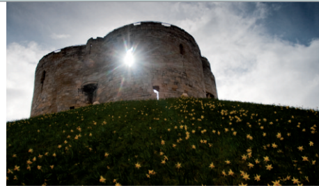
Clifford's Tower. This Norman quaterfall keep sits proud of its surroundings and offers excellent views across the city rooftops from its wall walk.