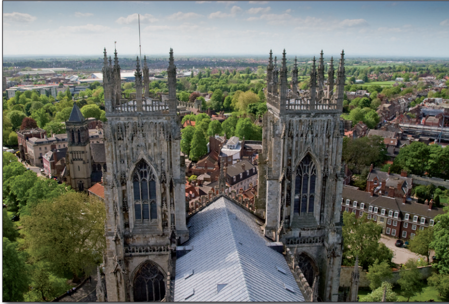
Above: The West Towers of the Minster viewed from the Central Tower. Not recommended for vertigo sufferers!

Right: York has a strong Viking heritage and plays host to a yearly Viking Festival culminating in an evening battle re-enactment by hosts of authentically costumed Vikings. They form a rousing lengthy procession through the city streets before battling below Clifford's Tower in the Eye of York.