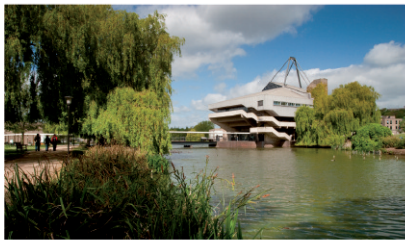
Central Hall at the York University campus. The university was conceived in the 1960s and continues to be one of the leading educational institutes in the country.