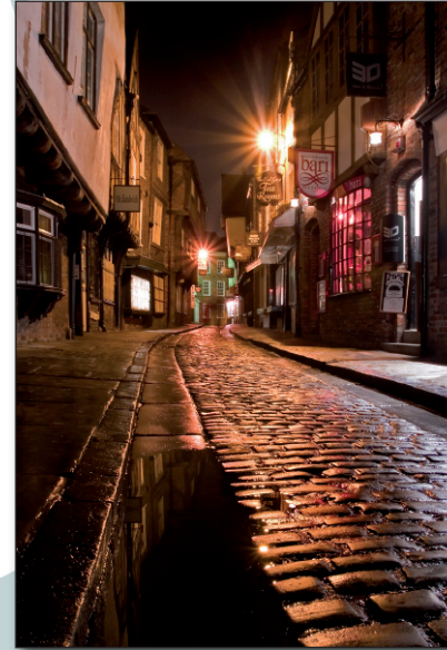
Above left: The medieval cobbled street of Shambles at night. The overhanging timber-framed buildings were originally used by butchers to sell their wares.